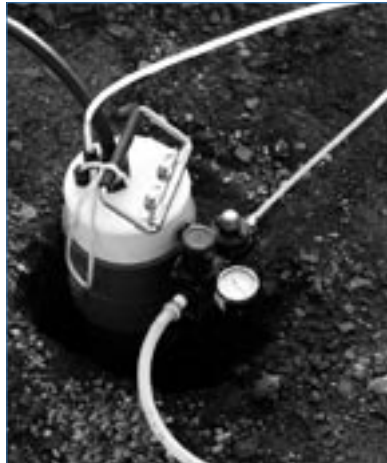
Well clincher and filter regulator in simple field installation.

The Well Clincher seals the well from debris and is available for wells with diameters from 2 to 8 in.