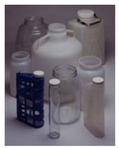
Bottle options are available for practically any sequential or composite application.

An optional telephone modem allows programming changes and data collection to be performed remotely, from a touchtone phone.