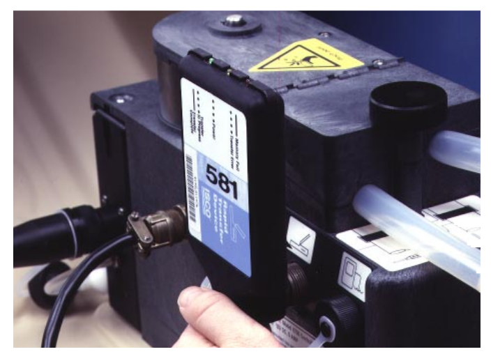
The Isco 581 RTD provides a fast, simple way to collect and transport data from 6700 Series Samplers.

Slim enough to fit in your shirt pocket, yet rugged enough to withstand submersion, the 581 RTD lets you quickly retrieve and transfer data without taking your laptop computer into the field.