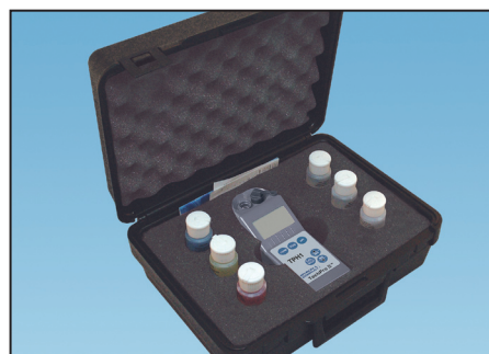
This foam-lined case (model PKU) provides extra protection and portability, making it easier to carry your TechPro instrument in the field.