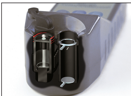
The pH sensor chamber protects a large-capacity, long life KCl reservoir.