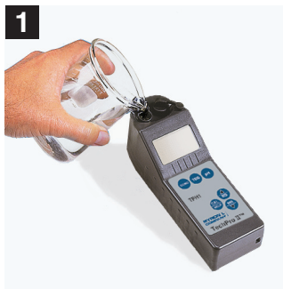
Rinse and fill cell cup