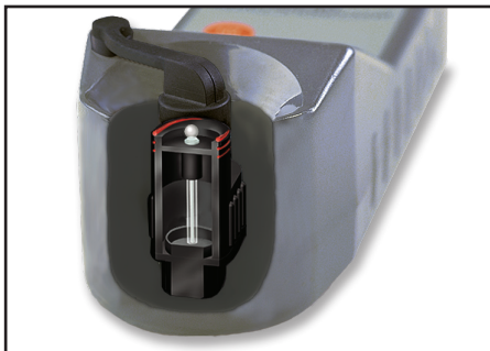
The pH sensor chamber protects a large-capacity, long-life KCl reservoir.