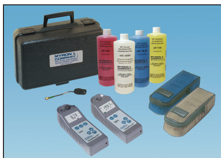
The TechPro Line of Accessories: pH Buffers, Standard Solution, Replacement pH Sensor, & choice of Soft or Hard Protective Carry Case