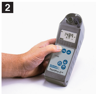
Push button to display reading