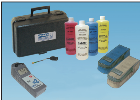
The TechPro II Line of Accessories: pH Buffers, Storage Solution, Replacement pH Sensor, & choice of Soft or Hard Protective Carry Case