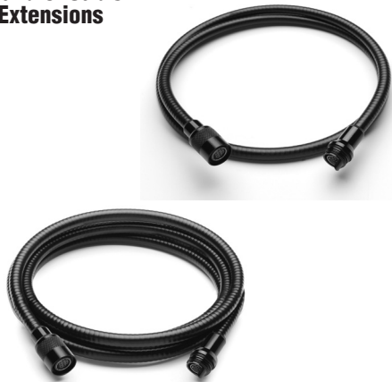
3' and 6' Cable Extensions