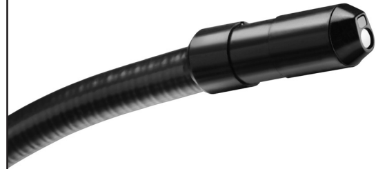
9.5mm Camera Head