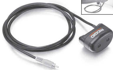
SeeSnake® Digital Adaptor