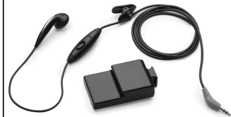
Audio Recording Accessory