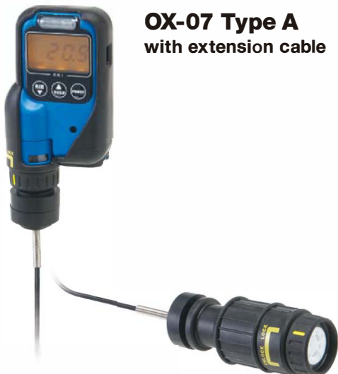
OX-07 Type A with extension cable