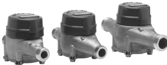
5/8" PMM ® (DN 15mm)

Operation: Water flows through the meter's strainer and into the measuring chamber where it drives the impeller. The impeller has a sapphire bearing and is balanced on a tungsten-based titanium stainless steel shaft. The drive magnet transmits the rotation of the impeller to a drive magnet located within the hermetically sealed register. The drive magnet is