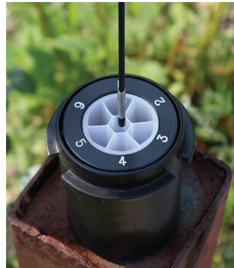
Measure Water Levels within the narrow channels of a Solinst CMT® System.

The 102M Mini Water Level Meter is available in 80 ft. and 25 m lengths. There is the choice of the P4 or P10 Probe.