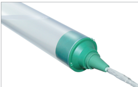
Model 428 BioBailer