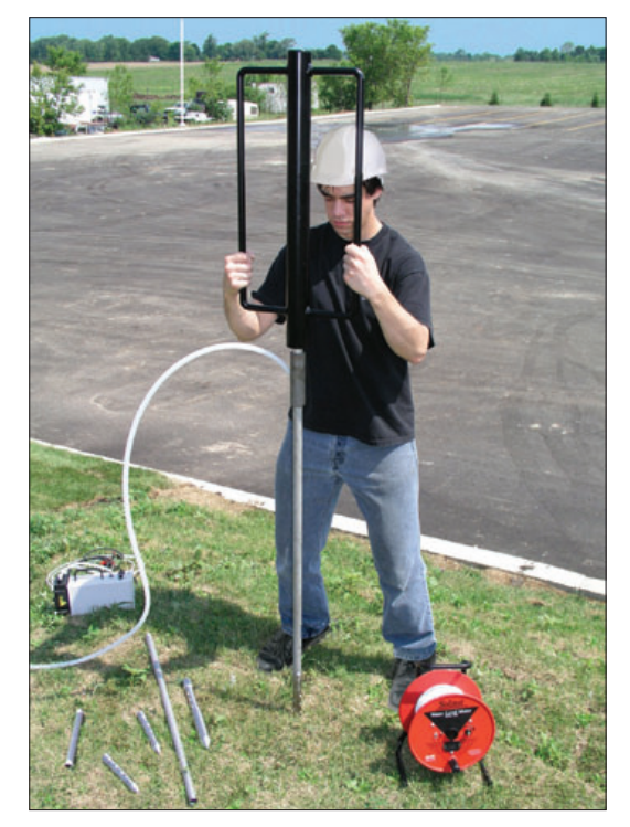
Installing Piezometers with a Manual Slide Hammer