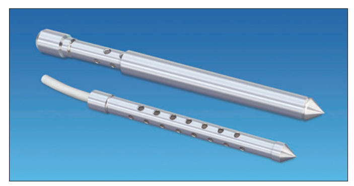
Model 615 Drive-Point and Shielded Drive-Point Piezometer

Solinst Drive-Point Piezometers can be driven into the ground with any direct push or drilling technology, including the Manual Slide Hammer shown at right. To avoid clogging or smearing of the screen during installation, a shielded version is also available.