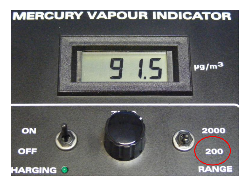
Range: 0-200 µg/m<sup>3</sup>

Unrivalled Gas Detection. Page 12 of 23 ionscience.com