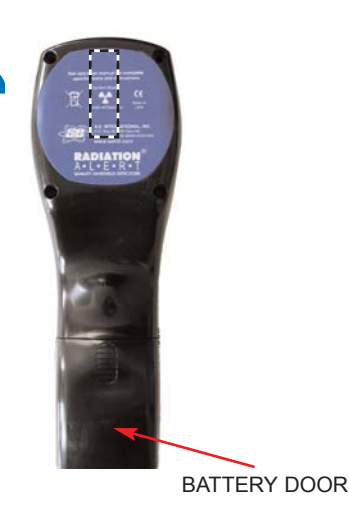
Illustration 2 MONITOR 4, 4EC, MC1K