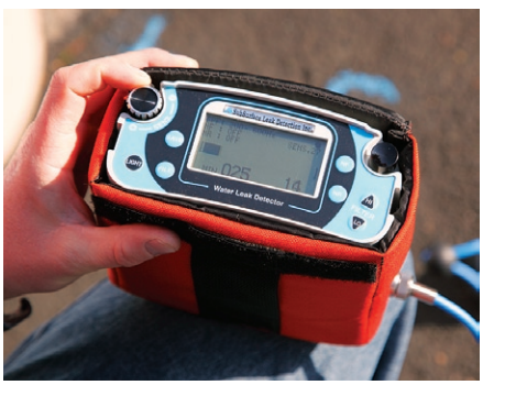
Use the Sensitivity Control to adjust the Sensitivity Level. Adjust so the Sound Level is between 30 – 70, and