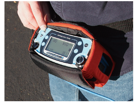
Use the LO Filters Control to remove extraneous continuous noises from motors, wind, and highways.